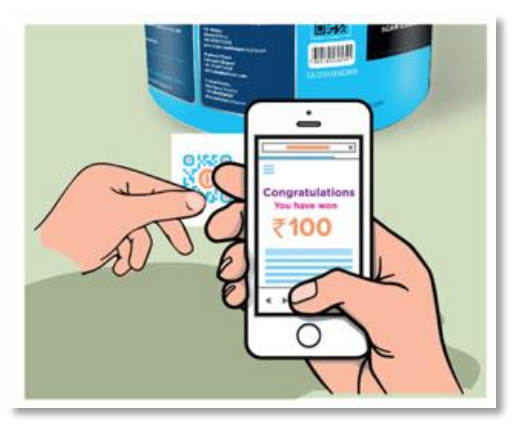
Peeled => Used once Replace coupons & manage promotions